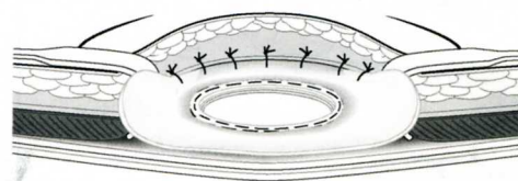
Figure 3 Once the circular stapling device has been removed, a mesh reinforced trephine is left behind. The edges of the mesh are then sutured to the anterior rectus sheath.