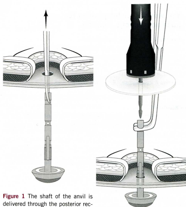
Figure 1 The shaft of the anvil is delivered through the posterior rectus sheath and mated with the trocar of the circular stapling device